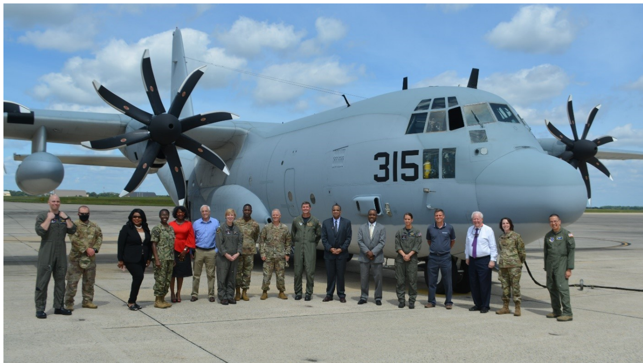
Joint Base Andrews Honorary Commanders participate in an immersion event with Naval Air Facility Washington and its leaders on June 25, 2021. As part of the event, they received a tour of one of the unit's C-130 Hercules aircraft.

Joint Base Andrews NAF Washington, MD 20762