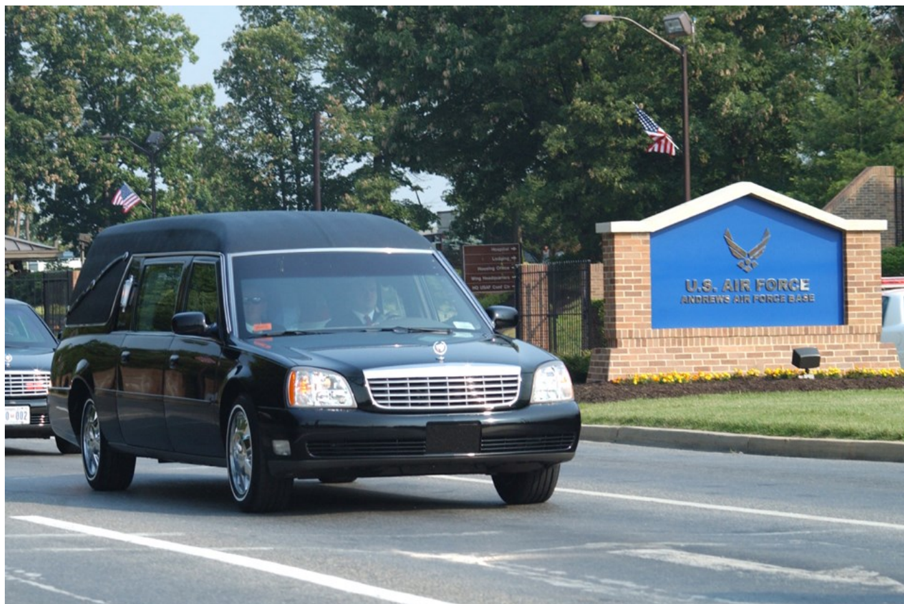
A hearse carrying the remains of former President Ronald Reagan leads a motorcade exiting Andrews Air Force Base in June 2004 before state funeral services in Washington, D.C.

dential flight out of Andrews on Nov. 24, 1946. In 1959, Detachment 1, 1254th Air Transport Group received its first jet aircraft, a VC-137. While the president's official aircraft, a C-121 nicknamed Columbine III, remained at Washington National Airport, the president often used the new VC-137 for longer trips. President John F. Kennedy's official aircraft, a C-118, permanently transferred from Washington National in March 1962, and Andrews officially became the "Home of Air Force One."