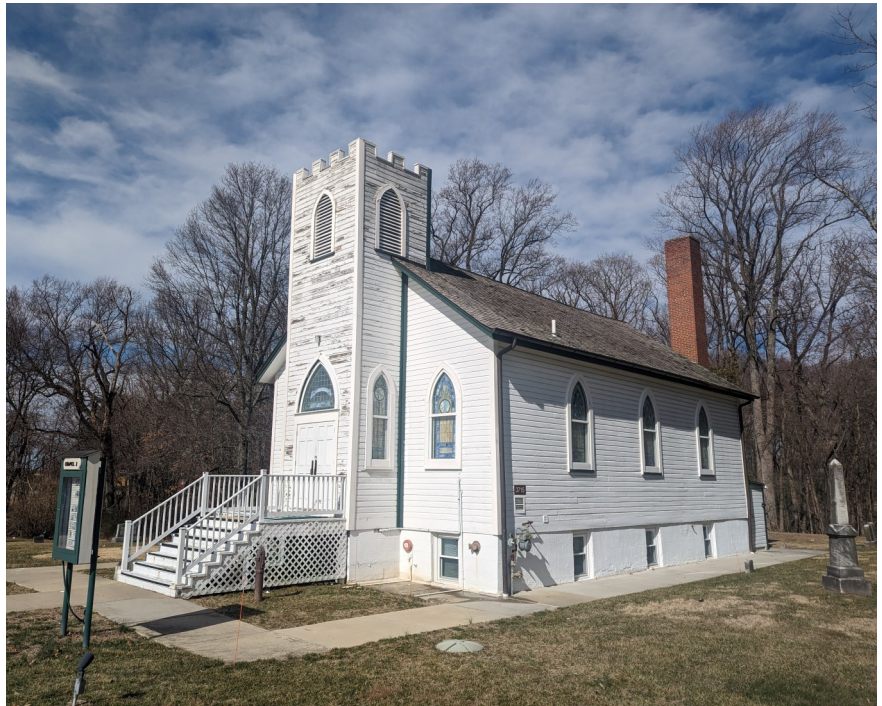
Chapel Two at Joint Base Andrews was built in 1854 and was used as a headquarters by Union troops in the Civil War. It became a chapel for the base in 1943 and is still in use today.

Camp Springs Army Air Field became operational May 2, 1943, when the first Republic P-47 Thunderbolt arrived, and 75 other P-47s followed that first month. The field's early mission was to train fighter pilots for overseas combat duty. The day after the first P-47 landed at Camp Springs, the general who the base would eventually be named after, Lt. Gen. Frank M. Andrews, died in a B-24 crash over Iceland.