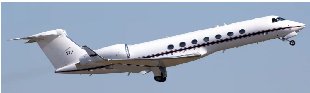
A Navy C-37, the military version of the Gulfstream 550, is flown by Naval Air Facility Washington to provide worldwide airlift for senior military leadership and dignitaries.