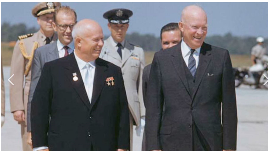
Nikita S. Khrushchev is greeted by President Dwight D. Eisenhower after landing at Andrews Air Force Base for the Soviet premier's 1959 visit to the United States. Khrushchev was the first foreign head of state to fly into the base, arriving on a Tupolev Tu-114.

However, almost since its establishment, Andrews has been known for its Special Air Missions — the transportation of senior government and military leaders. President Harry S. Truman was the first to fly on a presi-