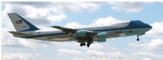
A VC-25A, referred to as "Air Force One" when the president is aboard, lands at Joint Base Andrews, Maryland.

The 89th AW has an exceptionally experienced and ready force of more than 1,400 personnel. The wing maintains an alert posture as well as 24/7 operations of the base aerial port, Andrews Network Control Station (ANCS), Government Security Operation Center