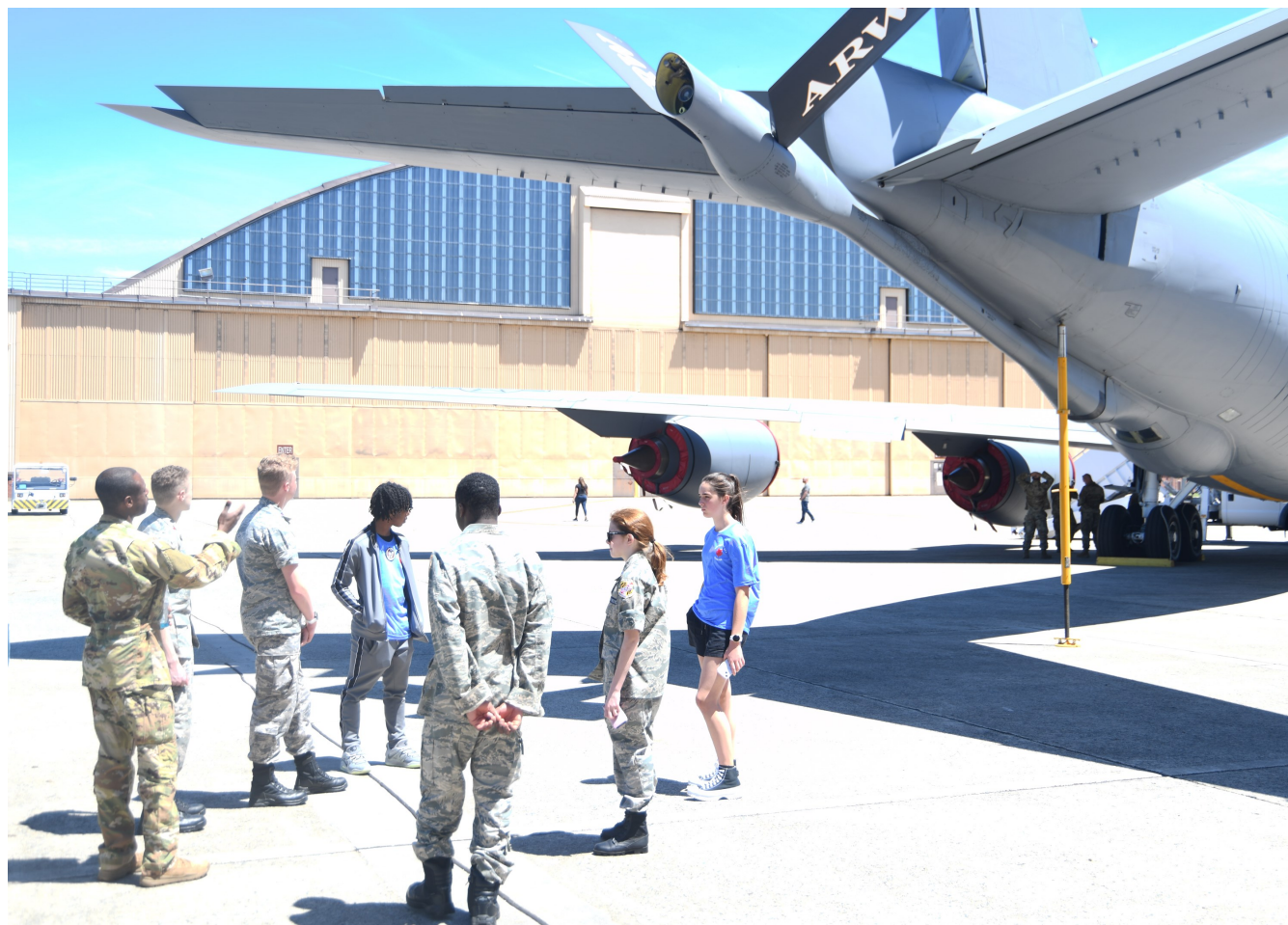
The 459th Air Refueling Wing participates in the JBA Aviation Inspiration Mentorship Day, June 8, 2024.

459th Air Refueling Wing Public Affairs (240) 857-6873