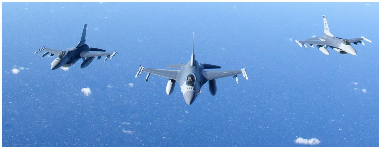
Three F-16 Fighting Falcon from the 121st Fighter Squadron, District of Columbia Air National Guard fly side-by-side in formation during Exercise Northern Strike Sept. 3, 2024.

ready, flexible, and capable of accepting and performing new and challenging missions.