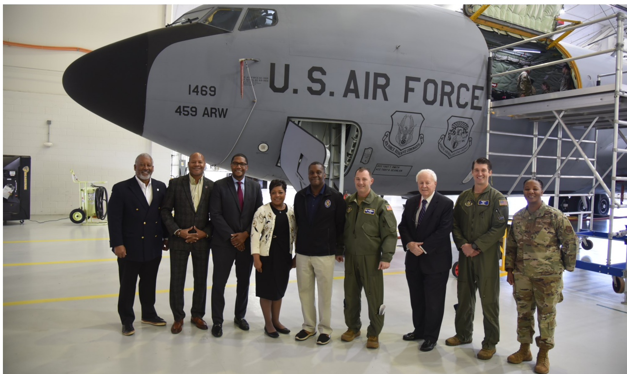
Honorary Commanders attend an immersion event with the 459th Airlift Wing on Oct. 24, 2023.